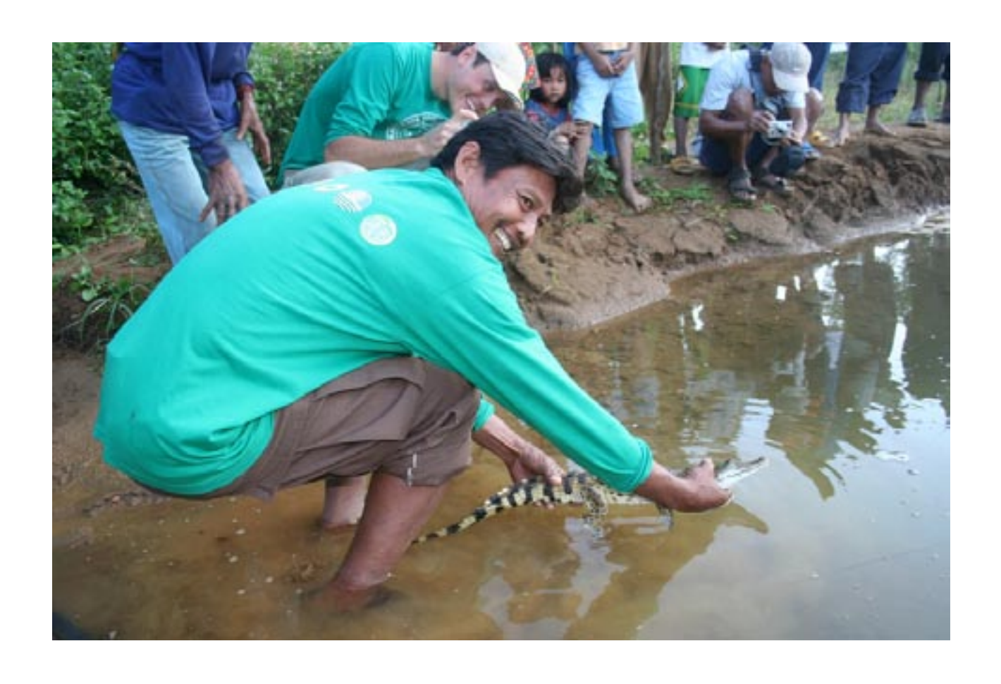
IUCN - World Conservation Union • Species Survival Commission

VOLUME 26 No. 1 • JANUARY 2007 - MARCH 2007