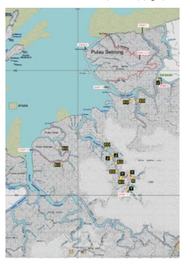
Figure 1. Southeastern coast and interior of Brunei Bay, Brunei Darussalam. Night count routes (dotted lines) and crocodiles sighted (dots and age class code) are included for rivers/tributaries surveyed north of the partly depicted Temborong River system. Survey numbers refer to location sequence in Table 1 in Cox (2006).

Fauna and flora surveys undertaken in 2000 and 2001 in the Pulau Selirong Forest Recreation Park (PSFRP) documented the occurrence of the Saltwater crocodile ( Crocodylus porosus ) (Charles 2002). On 23-29 May and 8-19 July 2006 systematic surveys of crocodiles were undertaken by Jack Cox and Forestry Department personnel, in PSFRP and other areas of Brunei Bay, northeastern Brunei Darussalam (Cox 2006) (Fig. 1).