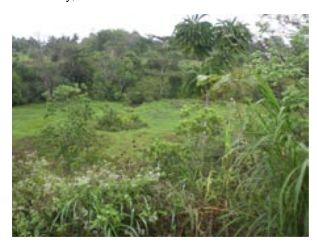
Figure 2. J.K. Mercado marsh land, a potential release site for C. mindorensis in Mindanao.

Many of these sites appear ideal for the release of C. mindorensis into the wild, and the Mercardo family are to be congratulated for acquiring suitable habitat at their own expense (Fig. 2), specifically to contribute to conservation of the critically endangered, endemic crocodile.