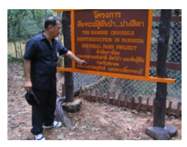
Figure 1. Project sign in restricted area of Pang Sida National Park.

unsuitable for a crocodile population and there is a plan to relocate this individual. Phu Kieow Wildlife Sanctuary is situated in central Thailand and surveys found a remnant population up in the water shed. There is still a question as to whether the record of C. siamensis at high altitude (750 m above sea level) in Khao Yai NP involves a released animal or a new population.