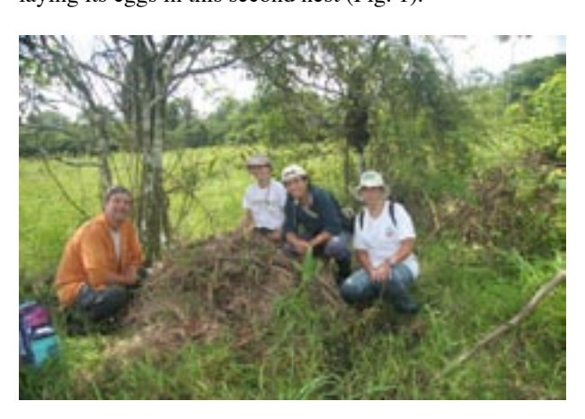
Figure 1. Instructor Dr. John Thorbjarnarson (left) with training course participants at a M. niger nest containing 62 eggs (see text).

Average clutch size was 32.3 eggs per nest. During this course we found the most extreme variation in clutch size ever reported for M. niger . One nest had only 3 eggs while another located 12 m away of it, contained 62 eggs, suggesting that the female from the first nest finished laying its eggs in this second nest (Fig. 1).