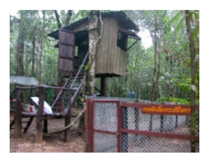
Figure 2. Temporary enclosure in the study area for acclimatization of crocodiles prior to release.

The training for wildlife rangers was completed in mid-2004, and included natural history of crocodiles, importance of crocodiles in the ecosystem, safe handling techniques for all-sized crocodiles, survey techniques and field data collection.