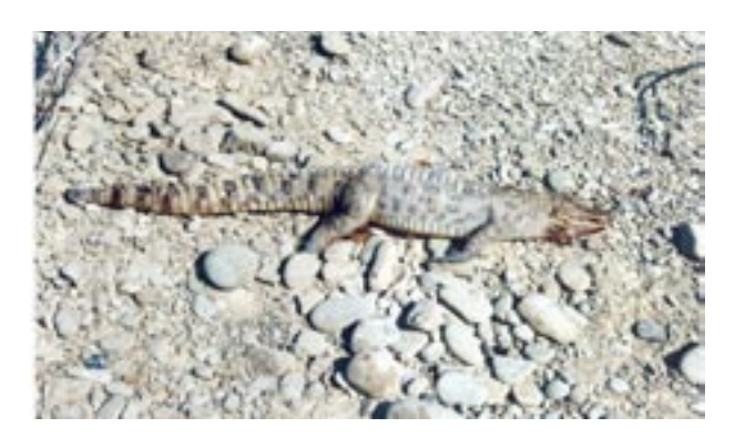
Figure 1. Juvenile Mugger crocodile killed by car strike.

Where crocodiles cross roads with no lighting, car strike is a potentially serious threat to the animals (Fig. 1). With such cases the final destination of the crocodiles was unclear, and due to the large areas involved, control measures and monitoring are impossible. Due to high speeds and numbers of cars, especially trucks, prevention of accidents with animals such as crocodiles would also seem impossible. Over the past three years, 5 strikes causing the death of the crocodiles were recorded. The average length of these juvenile crocodiles was 132 cm.