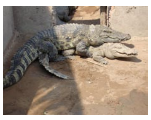
Figure 2. Two captive Siamese crocodiles attempting to mate on land.

EDITORIAL POLICY: All news on crocodilian conservation, research, management, captive propagation, trade, laws and regulations is welcome. Photographs and other graphic materials are particularly welcome. Information is usually published, as submitted, over the author's name and mailing address. The editors also extract material from correspondence or other sources and these items are attributed to the source. If inaccuracies do appear, please call them to the attention of the editors so that corrections can be published in later issues. The opinions expressed herein are those of the individuals identified and are not the opinions of CSG, the SSC or the IUCN-World Conservation Union unless so indicated.