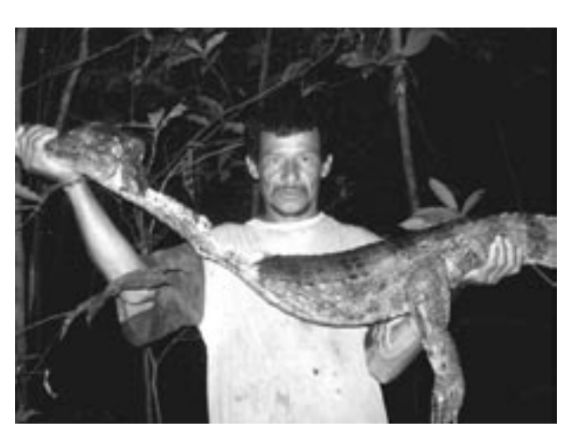
Figure 1. Female C. crocodilus predated by jaguar as it was guarding its nest.

Females were found in the vicinity of 36 (48.6%) of the C. crocodilus nests, hidden under tree roots, fallen trees or leaves. Estimated size of these females ranged from 45 to 80 cm SVL. Eleven nests were opened and clutch size varied between 2 and 35 eggs (mean clutch size= 24.9; mean egg length= 6.18 cm, SD= 0.51; mean egg width= 3.84 cm, SD= 0.22; mean egg weight= 53.71 g, SD= 8.56). Most nests contained eggs (73.0%), 17.6% had already hatched and 9.4% were predated. Local people were responsible for 57 % of predated nests, and the remainder were probably predated by Brown capuchin monkeys ( Cebus apella ), lizards ( Tupinambis teguixim ) or jaguar ( Panthera onca ). Predation by jaguar was registered once, eating only 4 eggs and also killing and consuming part of the female guarding the nest (Fig. 1).