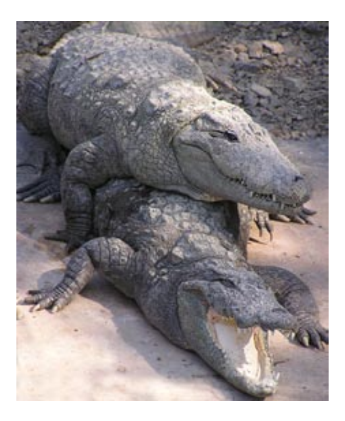
Figure 1. Two wild Mugger crocodiles attempting to mate on land.

Charlie Manolis, CSG Regional Chairman for Australia and Oceania, <cmanolis@wmi.com.au>.